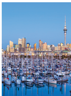
Auckland, City of Sails

Day 18: Queenstown/Rotorua We depart today for the Maori center of Rotorua, with its geysers, bubbling mud pools, and hot thermal springs. Upon arrival, we take a panoramic tour of this city on the shores of Lake Rotorua. This evening we visit Tè Puia Thermal Reserve and Cultural Centre for a traditional hangi dinner and Maori performance. B,D