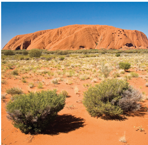
Aboriginal site of Uluru (Ayers Rock)

to Auckland, we stop at Ruakuri Caves to see the unique glowworms that illuminate the underground grottoes and caves. We reach Auckland late this afternoon; we’re on our own for dinner tonight. B