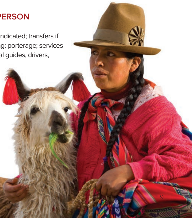
Peruvian woman with llama.

Cost Includes: Seven hotel nights; meals indicated; transfers if traveling on designated flights; sightseeing; portage; services of local guides and tour escort; tips to local guides, drivers, and tour escort; taxes and service charges. Not Included: Airfare; meals not indicated as included; alcoholic beverages; personal items.