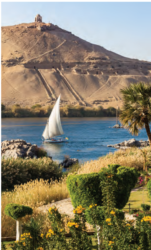
We sail traditional feluccas along the Nile.

Day 15: Depart for U.S. Very early this morning we transfer to the airport for our return flight to the U.S. B