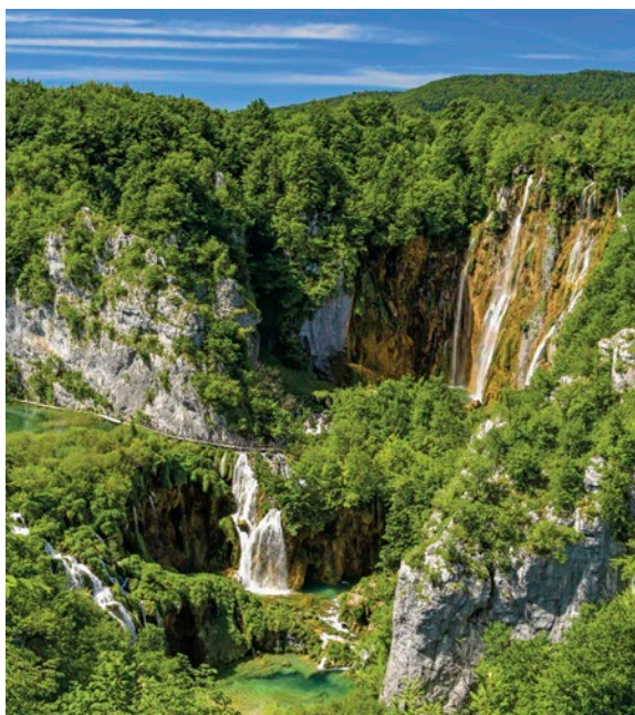
Plitvice Lakes National Park

Discover the bounty of Croatia on this incredible 10-night journey, including a seven-night Adriatic cruise! Explore one of the world's best-preserved medieval towns in legendary Dubrovnik. Then set sail along the Dalmatian coast on your first-class ship to enchanting islands and timeless ports. Walk along cobblestones brimming with maritime legends and see landscapes that stir your soul. Choose between touring the Cathedral of St. James or Krka National Park in Šibenik. Plus, revel in the wonders of Plitvice Lakes National Park, an astonishing natural marvel, before capping off your adventure in cosmopolitan Zagreb.