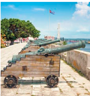
La Cabaña Fortress, Havana